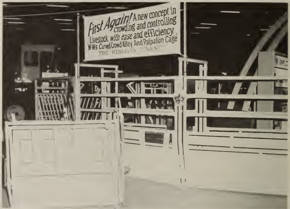
W.W. Cattle Handling Equipment.

Farmers' Petroleum Division, and a display by United Feeds.