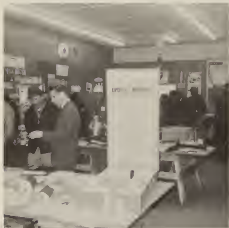
More modern equipment for the dairyman on display at Camrose.