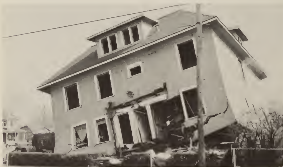
Our photographer, Gerry Senger, was perfectly sober when he took this picture. The only thing we can figure out is maybe the camera had a little bit too much. Or maybe it was the house. Anyway, like Humpty Dumpty, the house is all fallen down! Soon — across the street from Calgary Head Office — and where this drunken old house once stood, Imperial Oil will build a modern service station.

When time allows Mr. Cooper likes to tinker in his workshop.