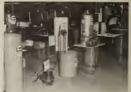
Meyers Pump System