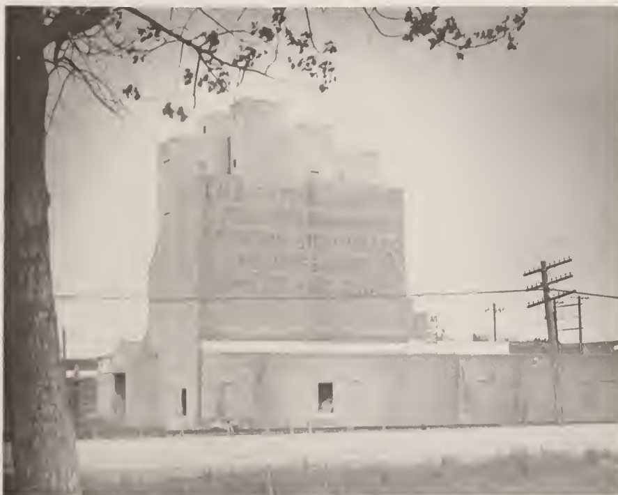
The mill at Midnapore.