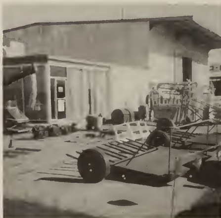
Outside automation displays at the Red Deer Farm Supply Centre.