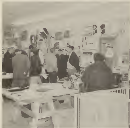
Busy, busy Westlock.